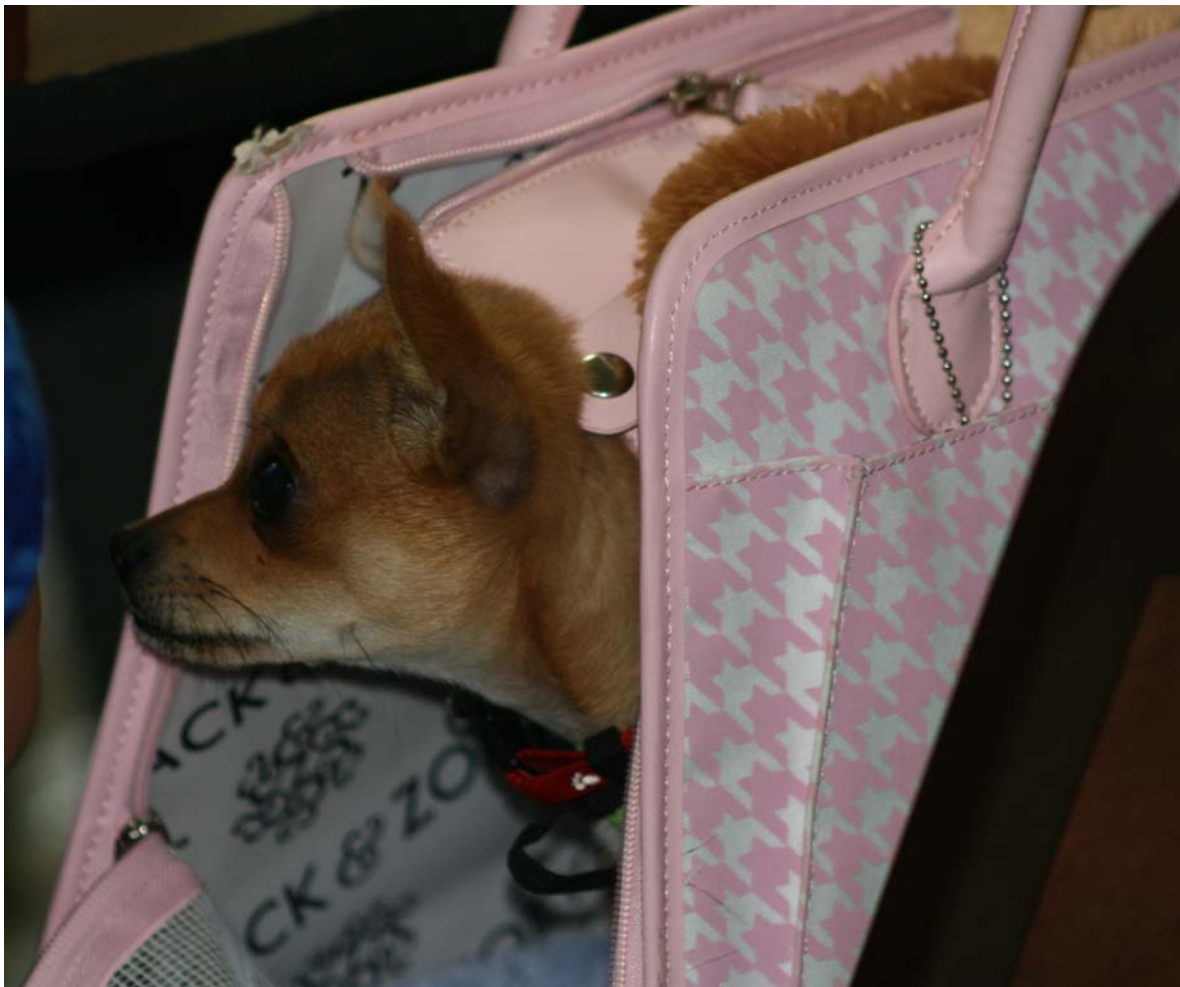
The Slant